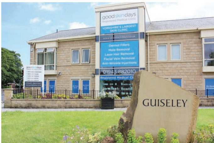
Our registered medical clinic in Guiseley, Leeds